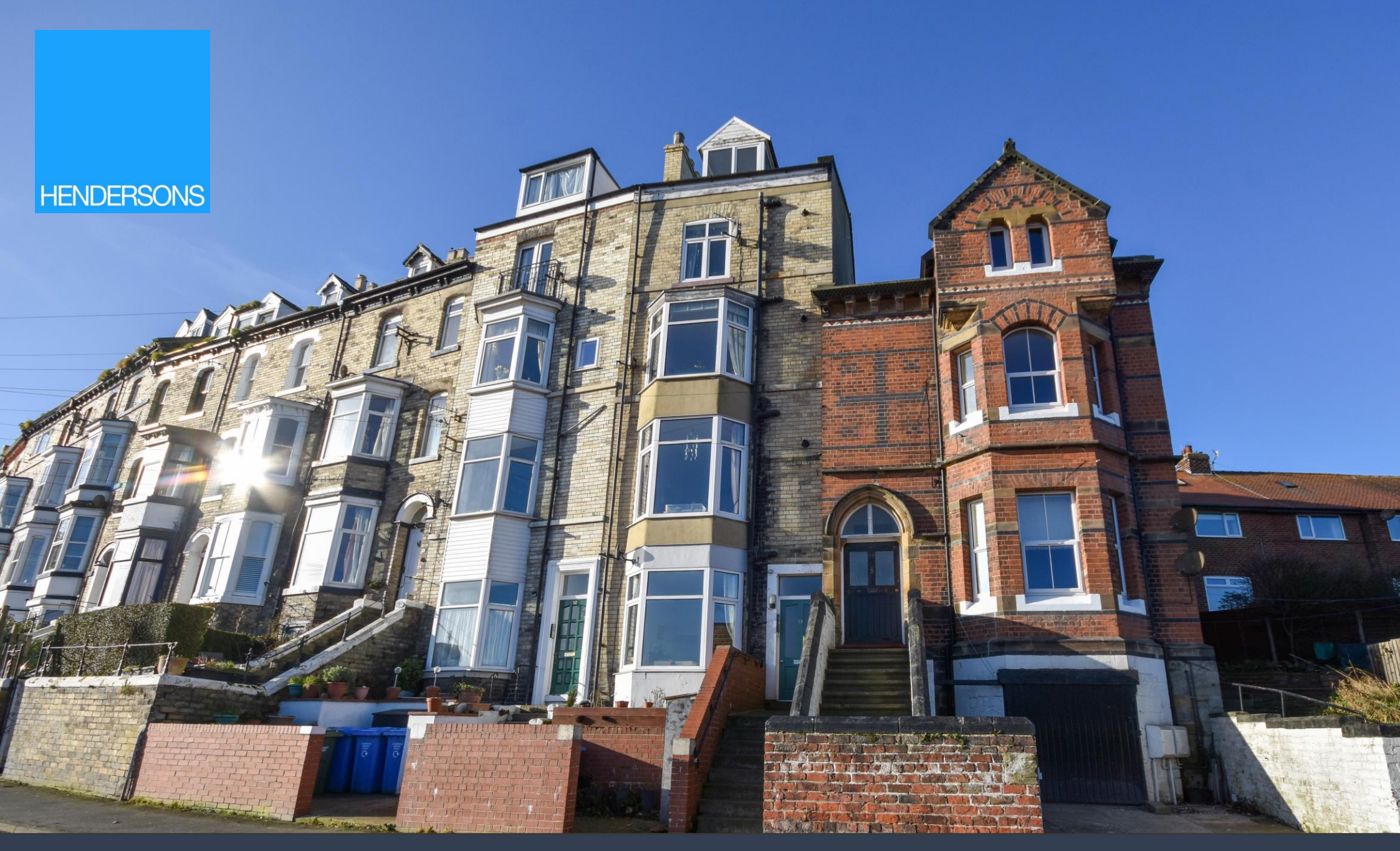
FLAT 3,13 WINDSOR TERRACE, WHITBY Guide Price £120,000